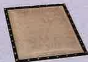
Membrane plate (only for Duplex Air Pro)