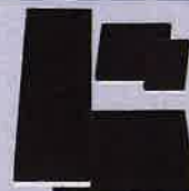
Set of 4 plates