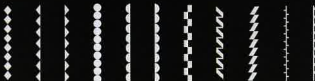
Custom sewing pattern examples

*Sewing data programming software (Option)