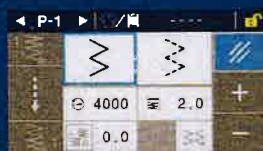
Quick home screen