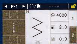
Detailed home screen

Displays the pattern list on the panel screen so you can select more easily.