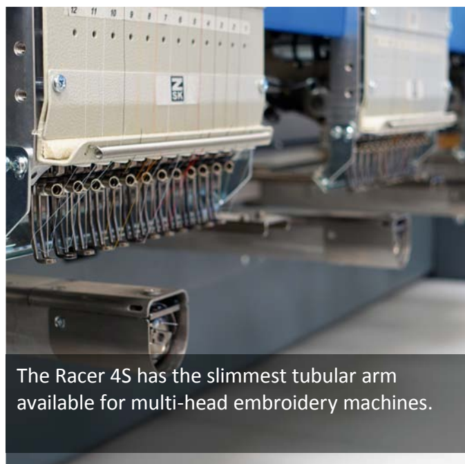
The Racer 4S has the slimmest tubular arm available for multi-head embroidery machines.