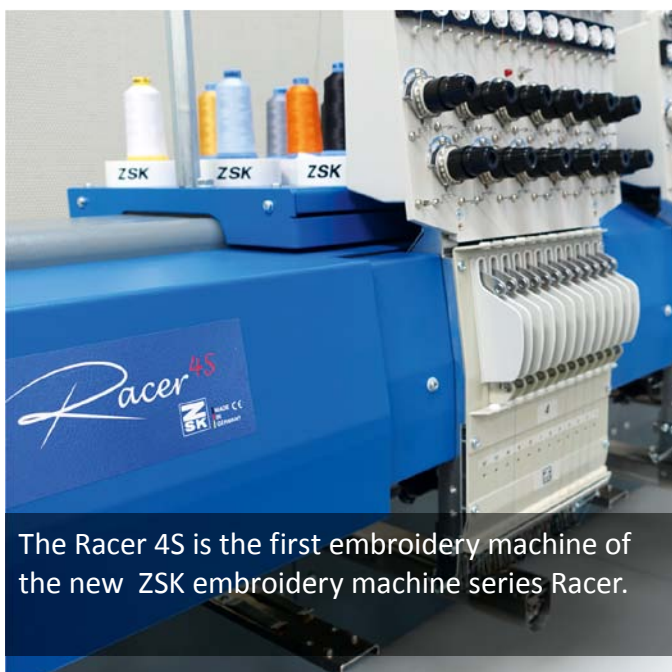
The Racer 4S is the first embroidery machine of the new ZSK embroidery machine series Racer.